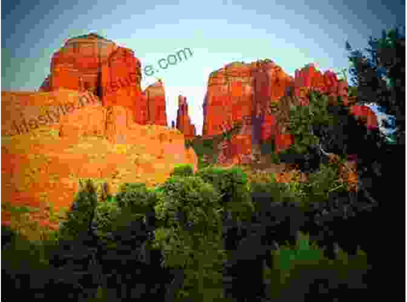
Hikers admiring the towering red rock formations of Sedona.