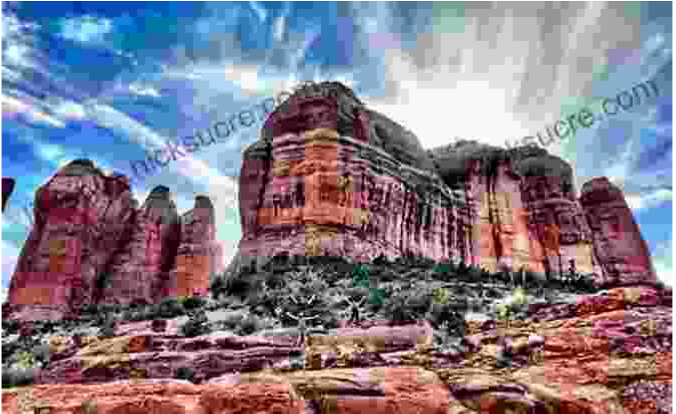
Hikers enjoying a scenic view of a vortex site in Sedona.