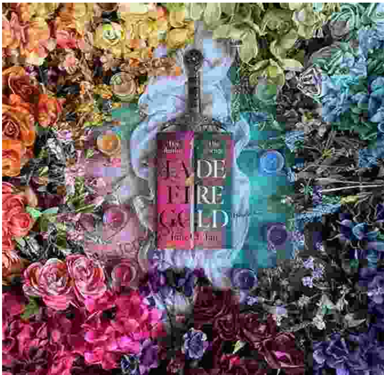
Unveiling the Philosophy Behind Jade Fire Gold

Jade Fire Gold's accessories are the perfect finishing touch to any outfit. From statement necklaces and earrings to delicate bracelets and rings, each piece is designed to add a touch of glamour and personality. The brand's signature fire motif is often incorporated into the designs, bringing an element of drama and passion. Bold shapes, vibrant colors, and intricate details make these accessories anything but ordinary.