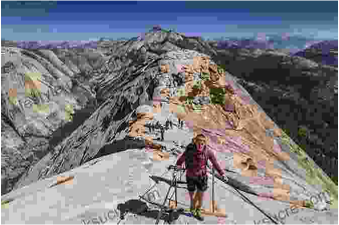
Half Dome, Yosemite National Park